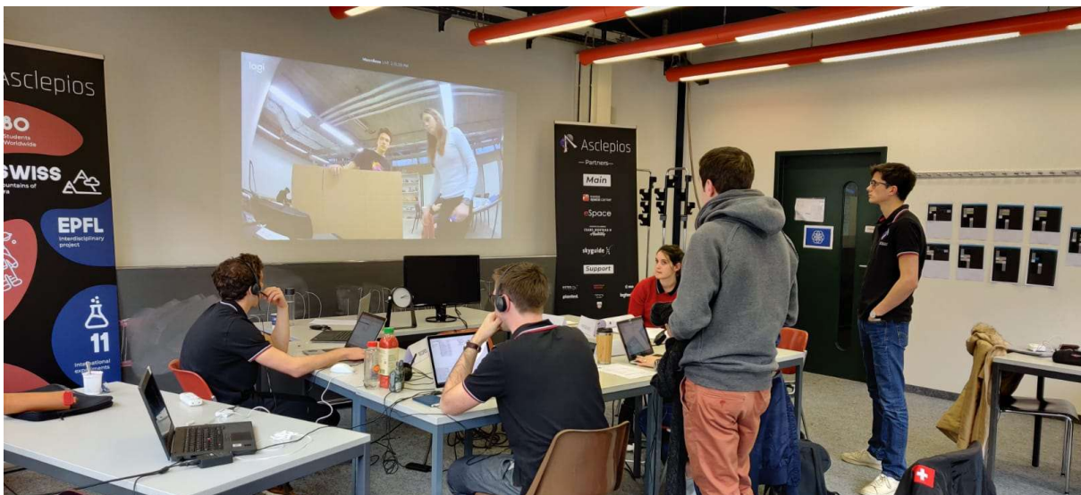
Mission control centre during the rehearsal of the Asclepios I Mission at EPFL.